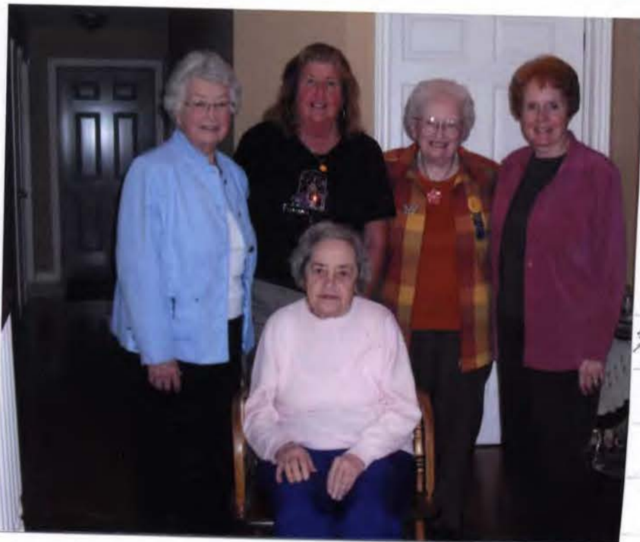
2010 - 2011 WI Members.