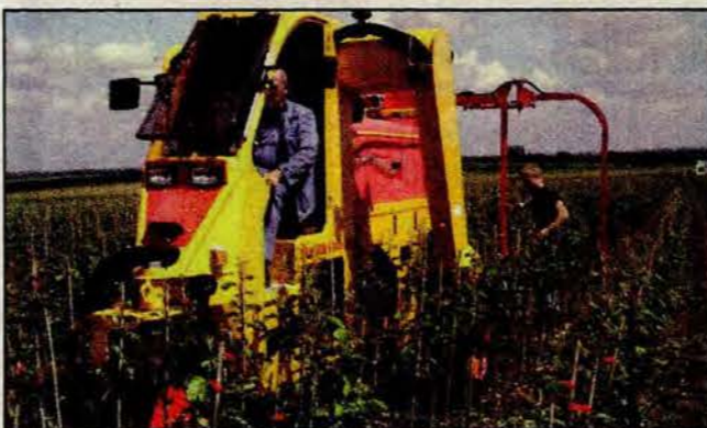
An example of the multi-trek tractor Van Brenk Fruit Farms is buying this spring to improve its production operations.