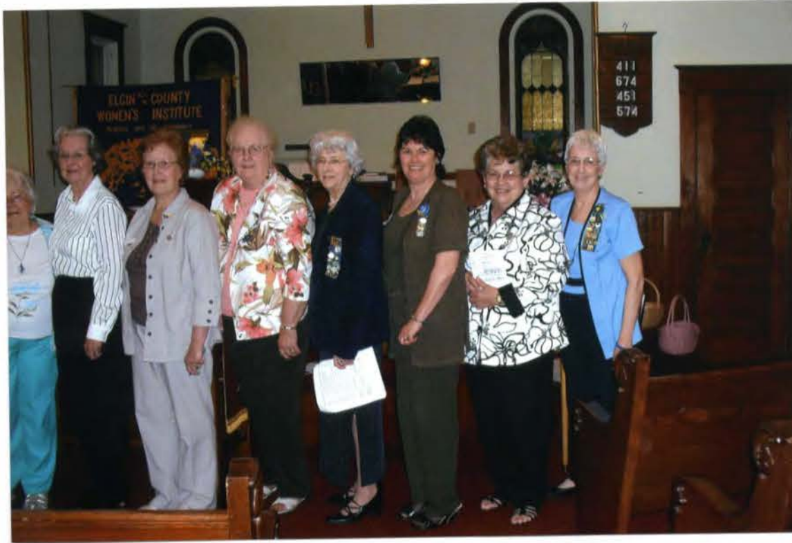
ELGIN COUNTY DISTRICT OFFICERS 2009-2010.