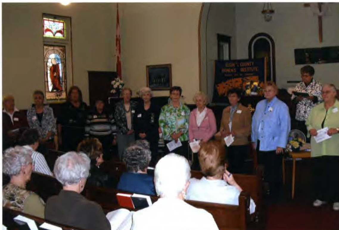
DISTRICT DIRECTORS from eleven Branches.